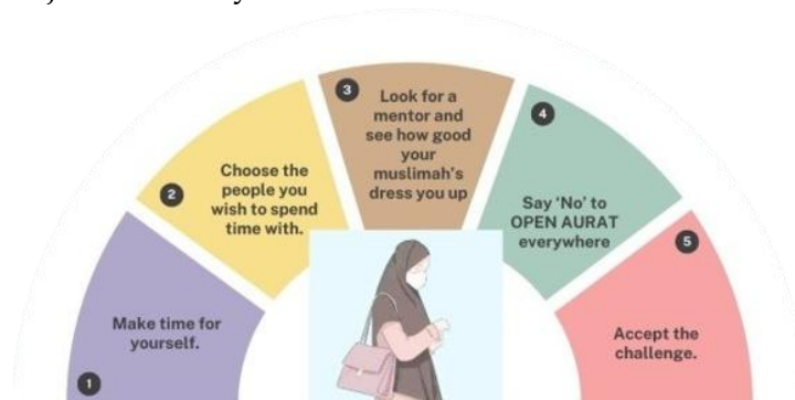
Figure 1. Advantages of Using the Maudhu'I Method in the Study of the Qur'an and Its Relevance in Everyday Life

Muslim women's clothing can be applied in the modern world of work. Principles such as modesty and covering one's private parts can be applied in the modern world of work by choosing clothes that are professional but still meet sharia standards." ARM and DS, as Muslim fashion entrepreneurs, confirmed that "Modern fashion trends can be aligned with sharia principles by designing clothes that are fashionable but still by the rules for covering the private parts, such as wearing a hijab that is stylish but not excessive."